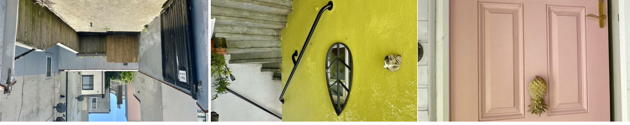
Flat 1, 12 Villa Road, St. Leonards-On-Sea, TN37 6EJ